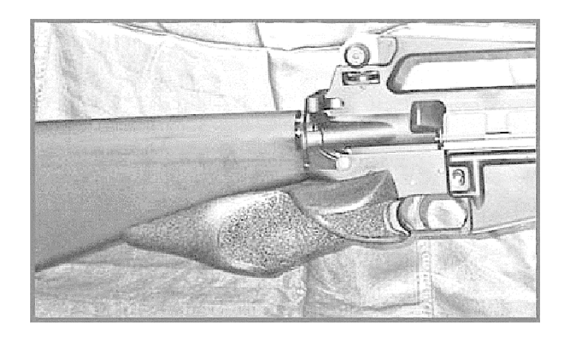
Gun Compliant Stocks.com's Solution to SB23

At least two companies are selling pistol grip replacements to bring at least some rifles into compliance. One company, Gun Compliant Stocks (on the web at <a href="http://GunCompliantStocks.com">http://GunCompliantStocks.com</a>), sells an English-style stock add-on that replaces the pistol grip on many of the affected rifles so that it no longer protrude "conspicuously beneath the action." For those of you who don't have web access, you can mail them at 1352-A East Edinger Avenue, Santa Ana, CA 92705. Phone: (714) 542-0818; FAX: (714) 542-0851.